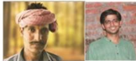
Poor Man = Ordinary Man But

Funds from Equalization tax will help to complete all the above mentioned projects within 5-10 years (including at least one home in every block of villages and every city of the country for disabled). It will result in to lower tax rates, more collection of taxes and no evasion of taxes, tremendous job and other opportunities in the above mentioned Infrastructure projects. No fear, better quality of life, cheaper products and agricultural produce and all countrymen busy in creation and development will create bright future of the country. There will be no difference between the government and a common man, as all will contribute towards the development and will help in, to provide honorable and prosperous life for every citizen of the country.