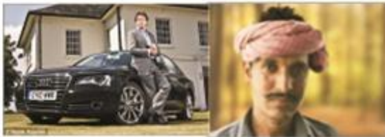
Rich Man = Not Poor Man